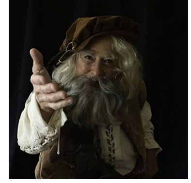
All shows performed live online via Zoom. For ticket information visit HawaiiShakes.org.

Aug 14-15, 20-22 at 7:30pm Aug 16, 23 at 2pm